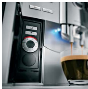
Advanced Programming Features