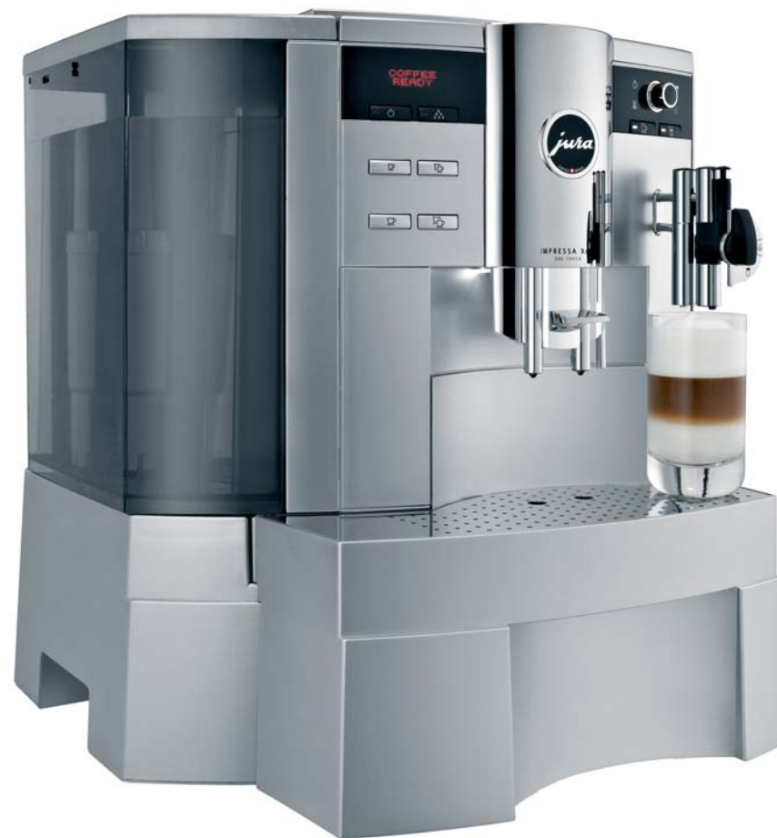
Jura IMPRESSA XS95 platinum OT