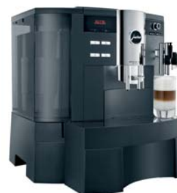
Also available: Jura IMPRESSA XS90 black OT