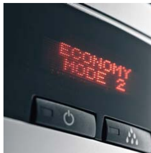
Energy Saving Mode

Using optional modules such as the Cup Warmer, with a matching Milk Cooler or an accounting Interface, the machine can be upgraded into an all-round coffee solution or optimized for self-service areas. Even people with little or no experience of coffee machines will find it a snap to operate because the controls are intuitive and easy to understand. The programming buttons are concealed discreetly behind a flap. And if circumstances require, these can even be blocked to only be accessible to specific users.