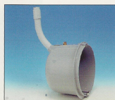
SP0600U Front-to-back: 7-15/16"