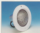
SP0580 Series Outside diameter of face rim: 10-3/4"

Models with suffix "L" are equipped with Automatic Thermal Switch (ATS). AstroLite Series light fixtures mount into DuraNiche Series niches only.