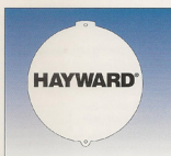
This convenient cover-up plate protects the interior of the niche and mounting threads during guniting.