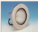
SP0580S Series Outside diameter of face rim: 10-3/4"