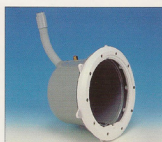
SP0607U Maximum O.D. of shell back: 10-5/8" O.D. of shell flange: 12-3/16"